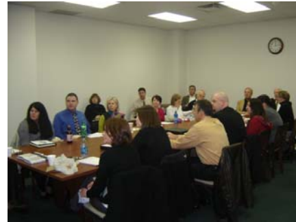
Cayuga County Chamber conference room packed for this Brown Bag Lunch Seminar!

More information contact: CNY Affiliate of Sandler Training 443 North Franklin Street— Suite 100 Syracuse, New York 13204 315-451-8797 315-471-8555