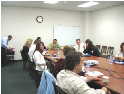
Cayuga County Chamber fills large conference room for seminar.

For more information on Internet Marketing For Business and Mobile Marketing or to see a video on Mobile Marketing please visit www.IM4B.com