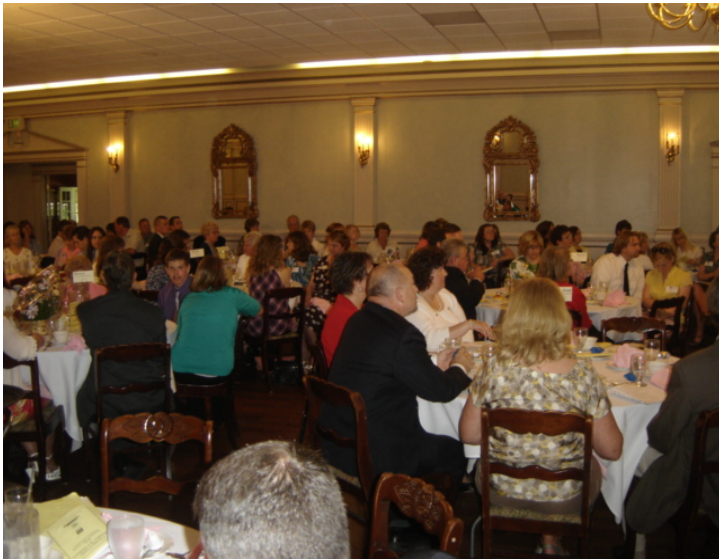
A large crowd of Cayuga County Chamber members and community leaders gather at the Springside Inn for the Chamber's 2010 Business Leader Award Luncheon.

***Nomination information for the 2011 Business Leader Awards is available on the Chamber website or by contacting the Chamber office***