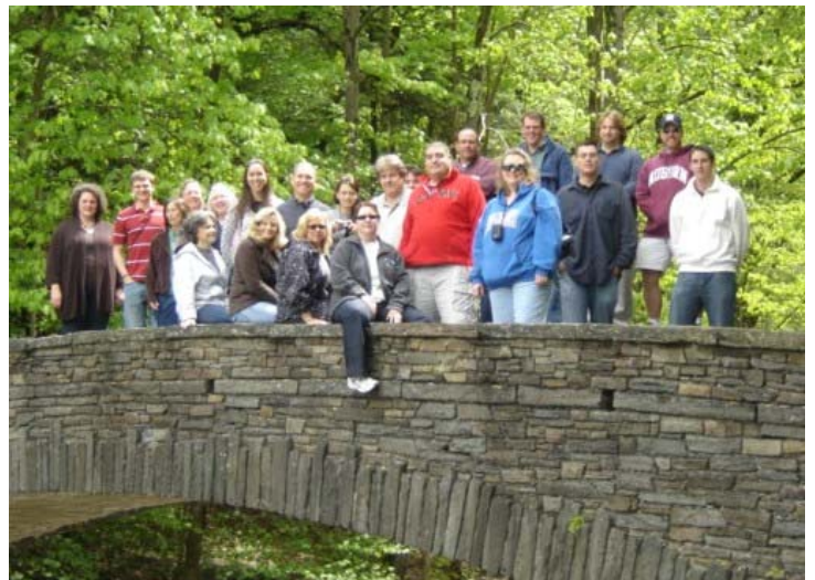
Leadership Cayuga Class of 2010 at Fillmore Glen