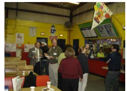
Chamber members mingle and enjoy the delicious food at Reva Rollerdrome.

If you are interested in holding a Chamber Business Event, please contact the Cayuga County Chamber office.