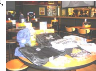
Door prize giveaways

In addition to Chamber members, our Ambassadors Council reached out to all businesses located within a mile of Buffalo Wild Wings, to provide an opportunity for them to learn more about Chamber benefits.